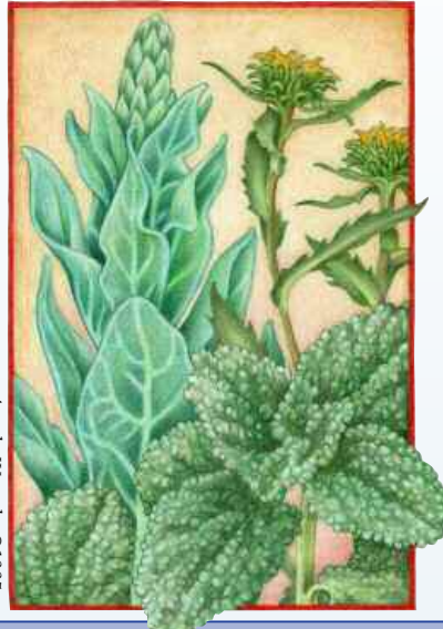
Angela Werneke ©1995

The powerful herbs in Lung Tonic™ offer targeted stabilization and support for ongoing respiratory challenges. Airway tissues become more resilient, your lungs are able to absorb more oxygen, and you begin to breathe more freely.